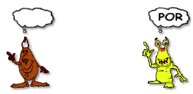
Fig. 2. An example of a thought configuration shown in Experiment 1 and 2.

Table 1 shows the frequencies of the eight distinct pattern sets used in all experiments (each was presented twice) along with the predictions of a Bayesian structure selection procedure employing the two types of determinism priors.<sup>4</sup> The sets were selected with the goal that the cause-and-effect roles of the variables were counterbalanced for each prior (subsets indicated by an "a" vs. "b"), ensuring that preferences for position (e.g., a preference to assign the cause role to the left-hand side variable) do not influence the assignment of subjects to clusters.